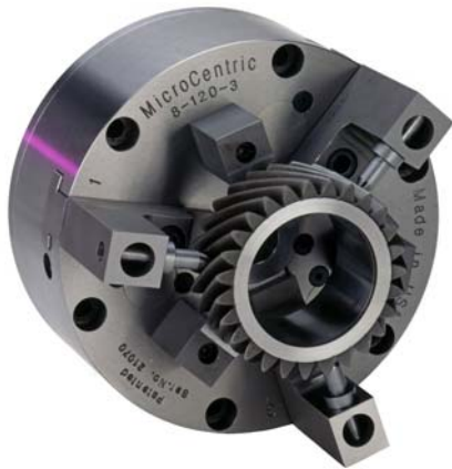
3 Jaw Air Chuck with special PD clamping top jaws and part stop

MicroCentric fully guarantees each special turnkey workholding system to perform to agreed upon accuracy and specifications. MicroCentric's superior engineering, quality manufacturing and advanced workholding technology are your assurance that the system we supply will be the finest system available from any source for your application.