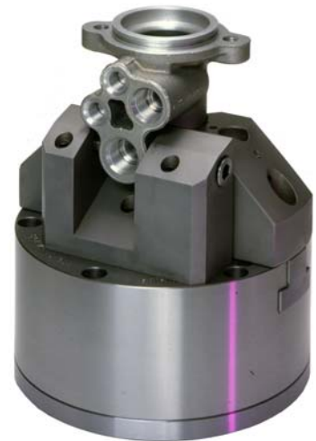
2 Jaw Air Chuck with special top jaws and part locator