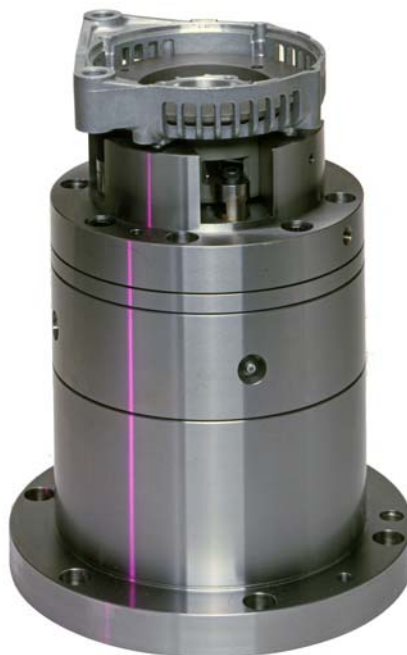
Face clamping chuck with hydraulically actuated locking part locators and supports